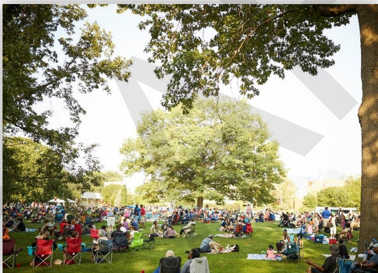
University Circle Inc.s' WOW: Wade Oval Wednesdays has received CAC funding since 2008.

These are general guidelines and are subject to change based on the total CAC funds available to the Project Support grant program in any given year. It is possible that all of the allocated Project Support grant funds could be awarded to those applicants receiving higher scores and applicants with lower scores (within the 75-100 point range) will not receive funding.